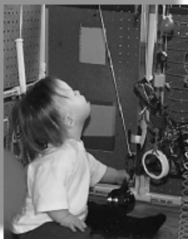
A Boyer child at play in the "Little Room."

screen is used to separate the toy from background objects and distractions, children with CVI can more easily see the toy. Too much visual stimulation can be confusing for children with CVI, but a high contrast environment can help the children differentiate between objects